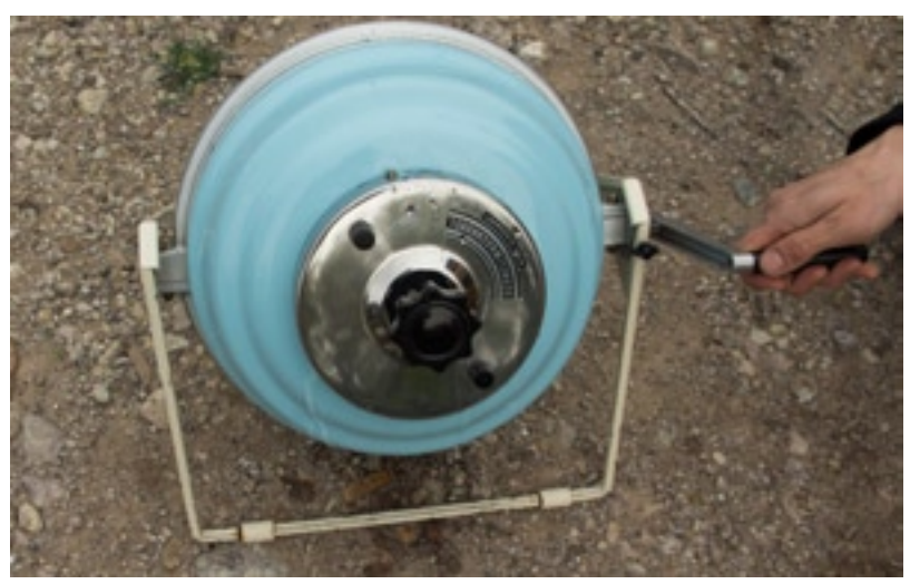
Hand laundry machine

A wood oven heats the house in winter. Since the temperature rarely drops below 5°C, you can just heat up the oven in the morning and add wood one more time throughout the day.